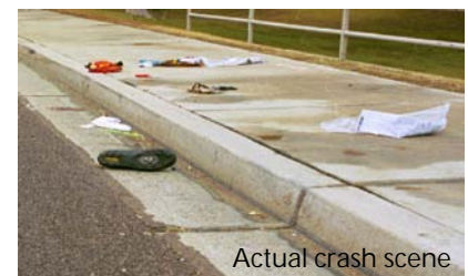
Actual crash scene

Here's the way we see it - When our Outreach Department is pressed into action, it means we are too late. Somehow it means we have failed to educate someone, whether it be a cyclist or a motorist. We urge you to help us in making Outreach the tiniest of our efforts. Help us fight the fight for safer roads for everyone!