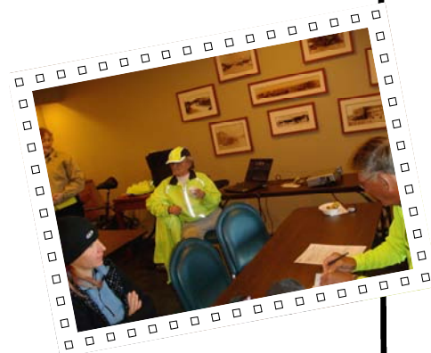
ROAD 1: IN THE CLASSROOM AND ON THE ROAD